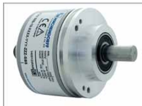
Incremental encoder WDG158B

Please compare your choice with the requirements of the safety unit.